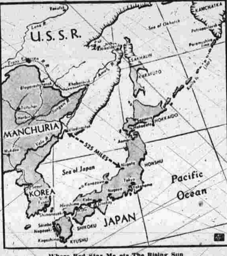
Where Red Star Meets The Rising Sun